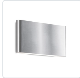
AT68010-BN-UNV Brushed Nickel